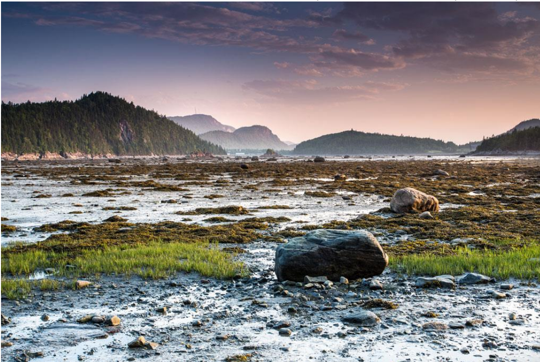
Parc National du Bic

Bring sport clothing and footwear for outdoor activities (hiking shoes and rainproof clothes) as we will have a tour in one of the most beautiful parks of Québec, Le Parc National du Bic , on Wednesday afternoon. Please notice that lunch will be earlier that day in order to be at 1:00 pm at the park.