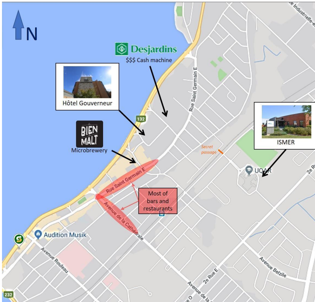
Figure 2: Map of Rimouski with main attractions